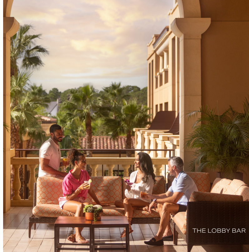
THE LOBBY BAR