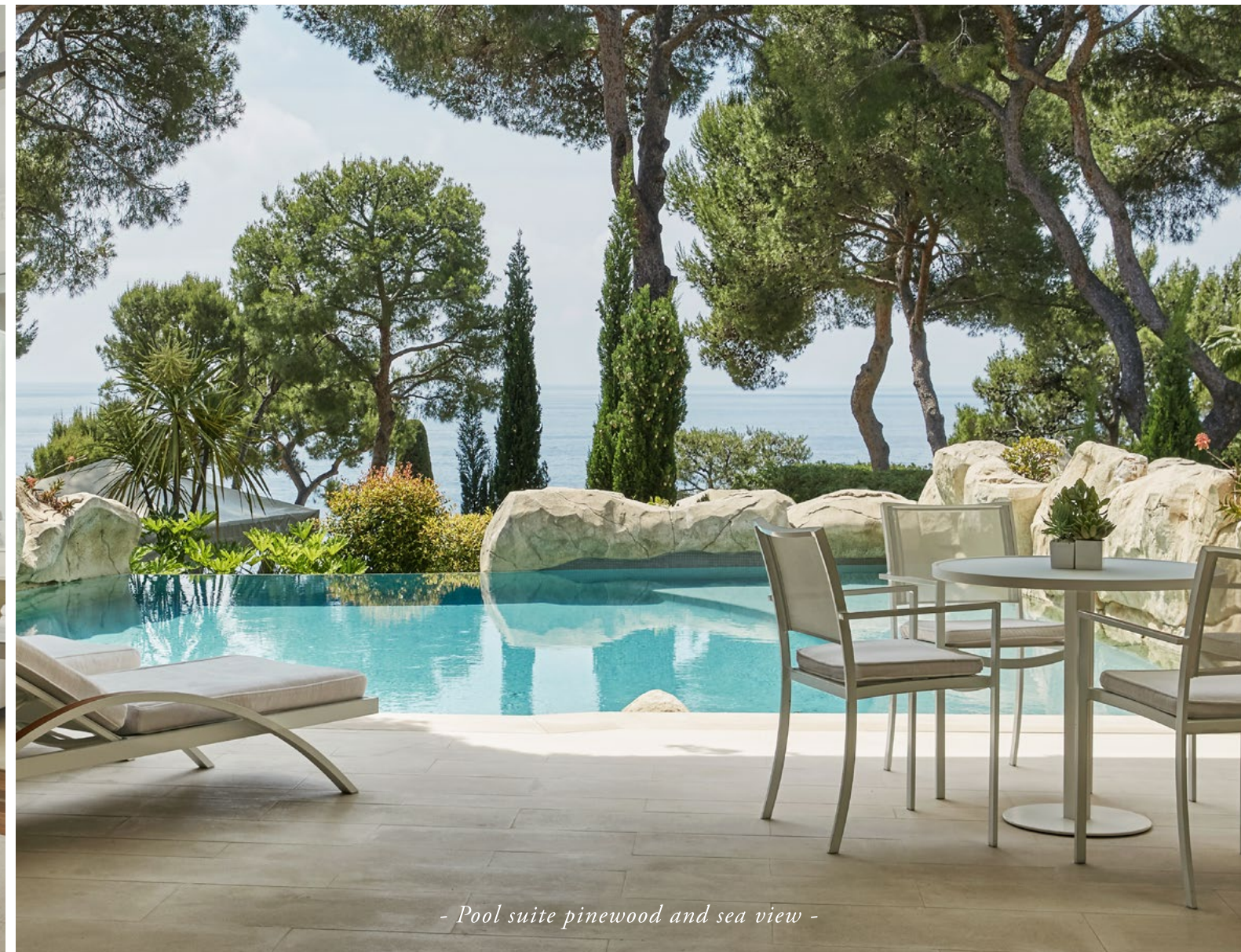
- Pool suite pinewood and sea view -