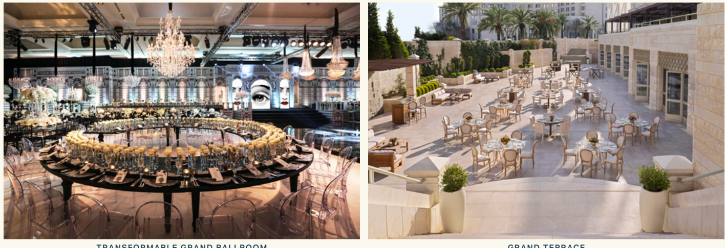
TRANSFORMABLE GRAND BALLROOM