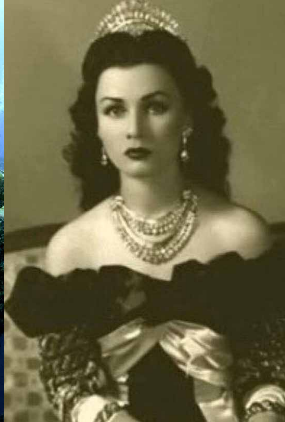
FOUR SEASONS HOTEL ALEXANDRIA AT SAN STEFANO