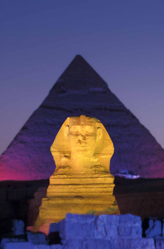
FOUR SEASONS HOTEL CAIRO AT NILE PLAZA