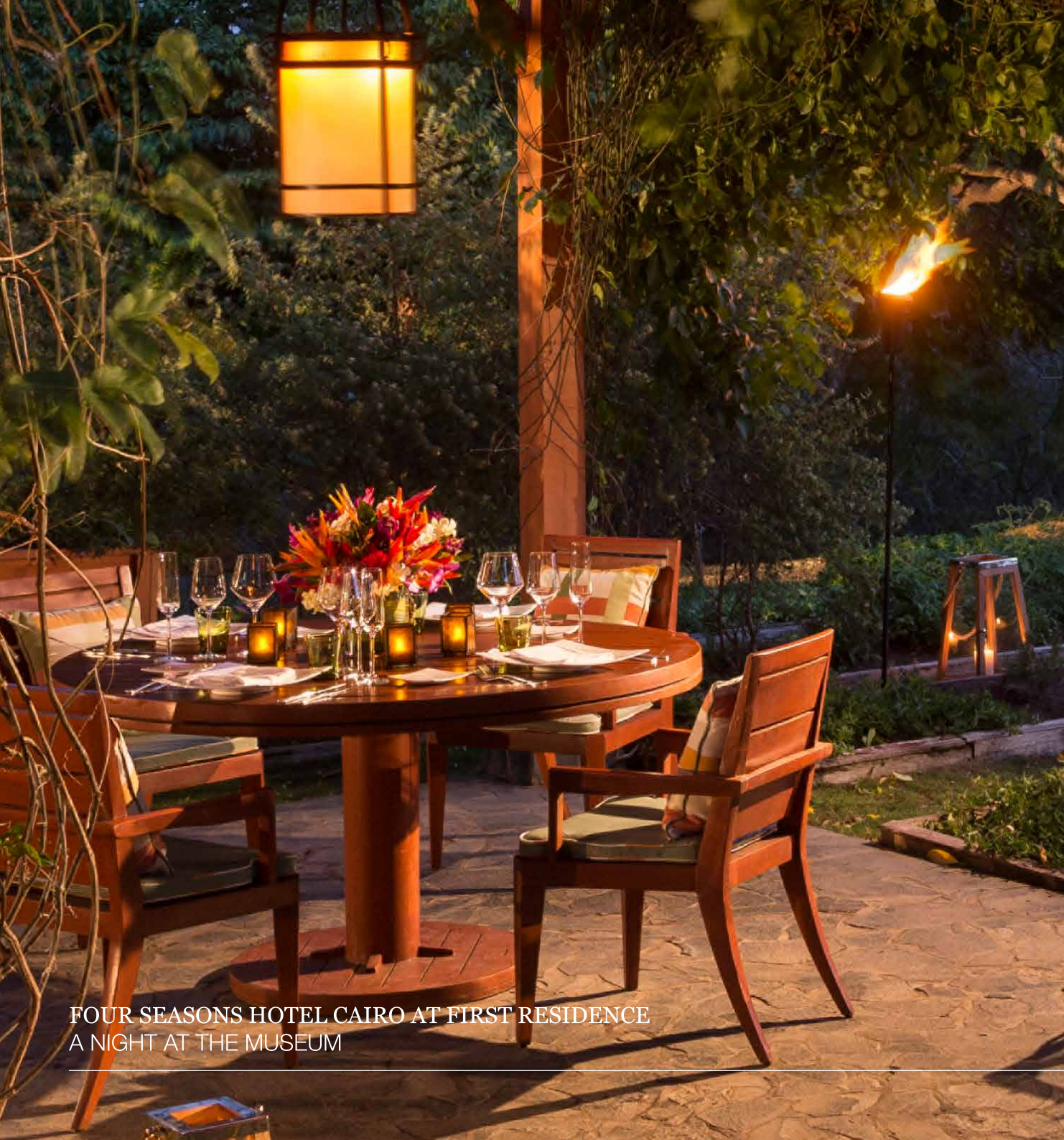
FOUR SEASONS HOTEL CAIRO AT FIRST RESIDENCE A NIGHT AT THE MUSEUM