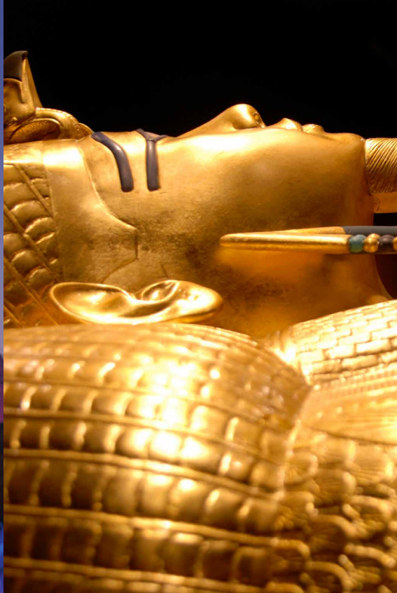
FOUR SEASONS HOTEL CAIRO AT FIRST RESIDENCE