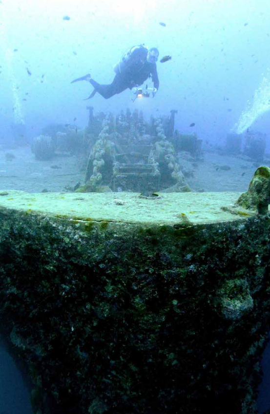
FOUR SEASONS RESORT SHARM EL SHEIKH